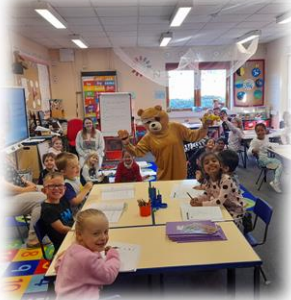
Pudsey with Year 1

Earlier this week a message was sent on the school app about Squid Games and inappropriate viewing. However, it turns out that many of the children are playing innocently on Roblox which has a replica game called Squid Games. I have looked at it myself and children can play the same games as are portrayed in the film and characters use guns to shoot and kill. It would be wise for parents to look at the game content with their child and prevent our young children from playing violent games which could be mimicked on the playground. Thank you in advance for your support.