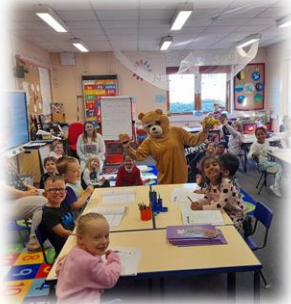
Pudsey with Year 1