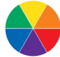
Primary and Secondary Colors